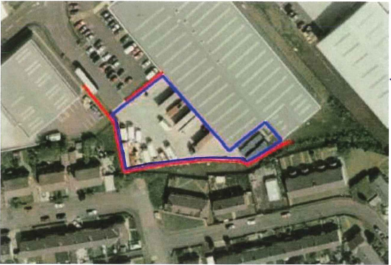
AERIAL PHOTO 1