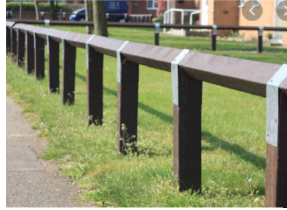
Example of timber birds mouth fencing proposed