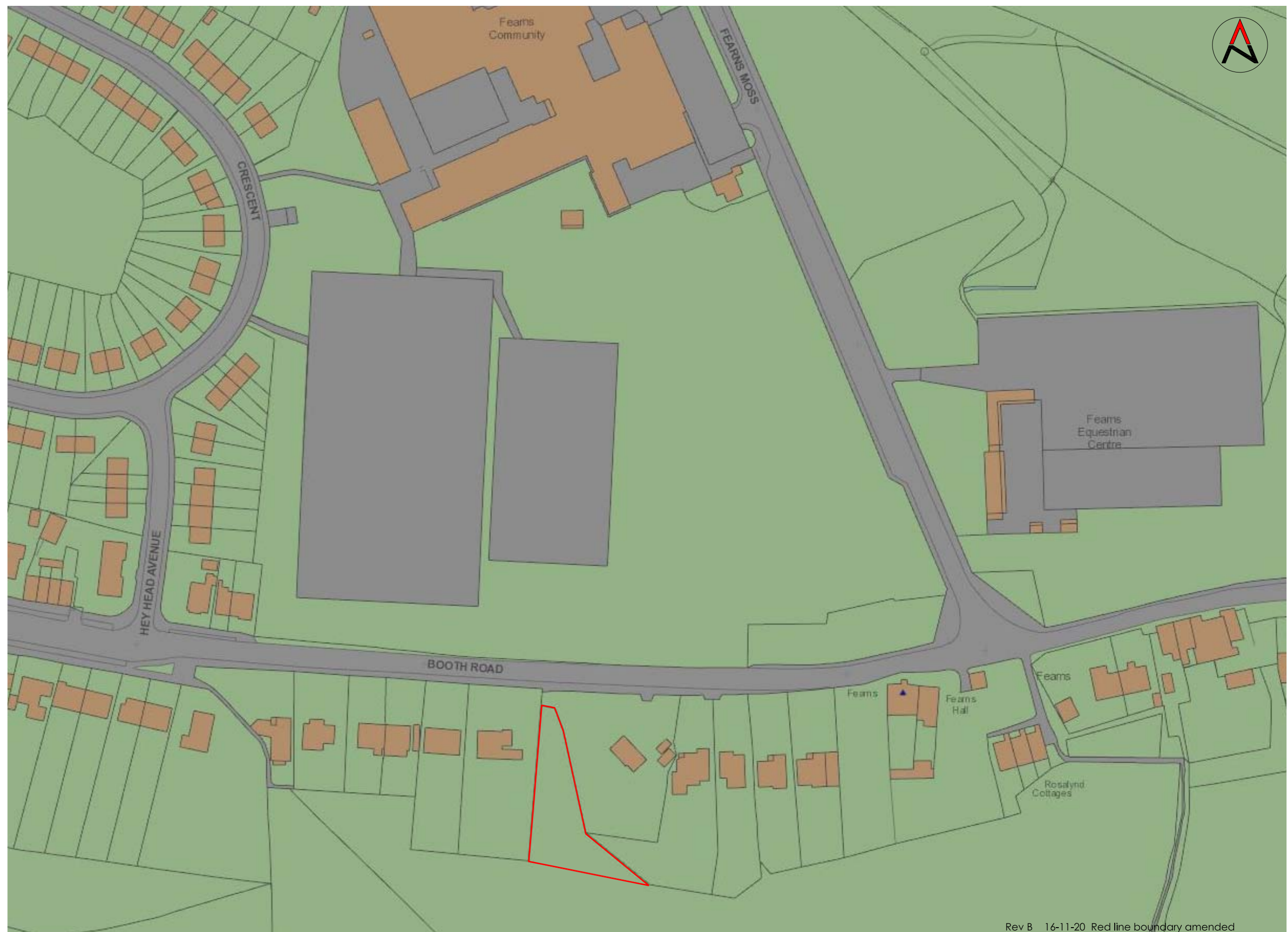
Location plan 1:1250

Rev B 16-11-20 Red line boundary amended Rev A 17-10-19 Location plan increased to show 2No road junctions and names