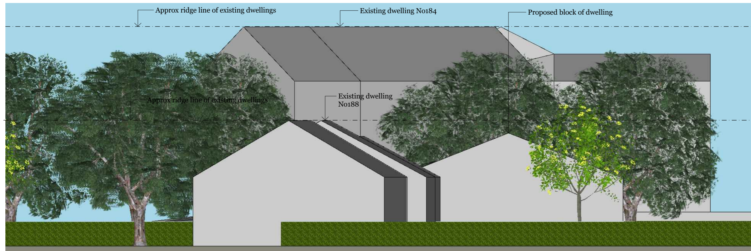
2 Proposed West Block Elevation Scale: 1:100

Rev A 19-06-20 Proposed dwelling reduced in size revision