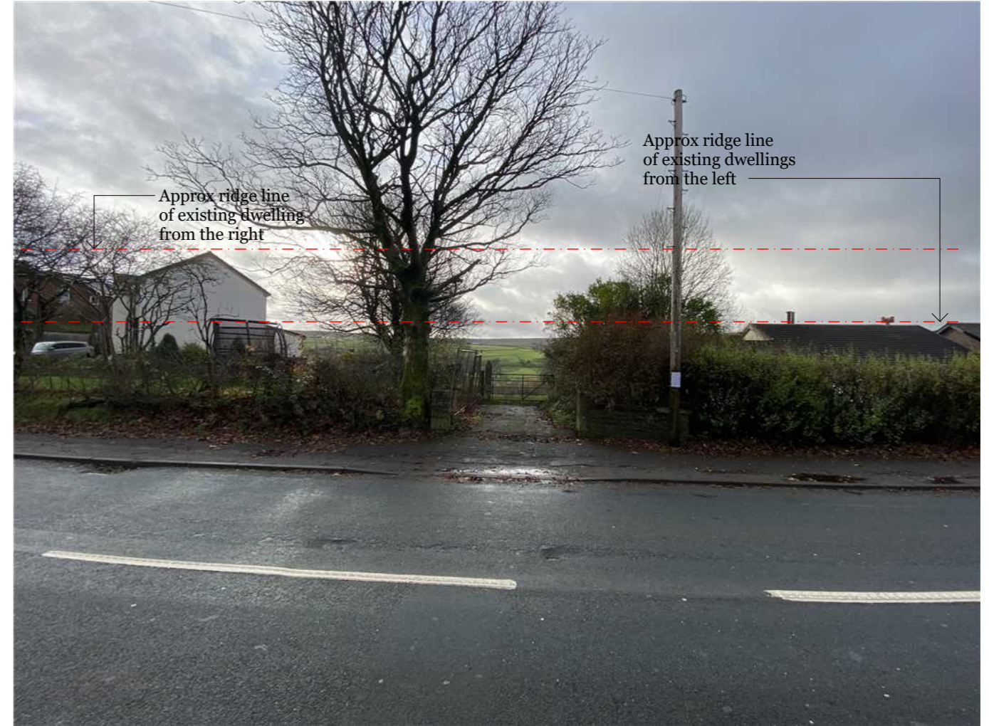
2 Existing Visual from Booth Road Scale: NTS