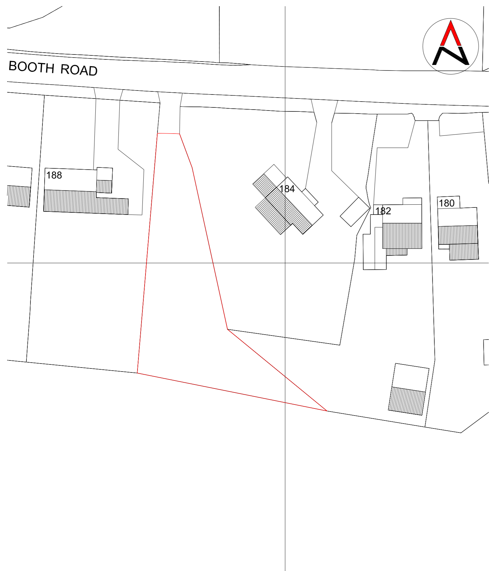
Site plan 1:500