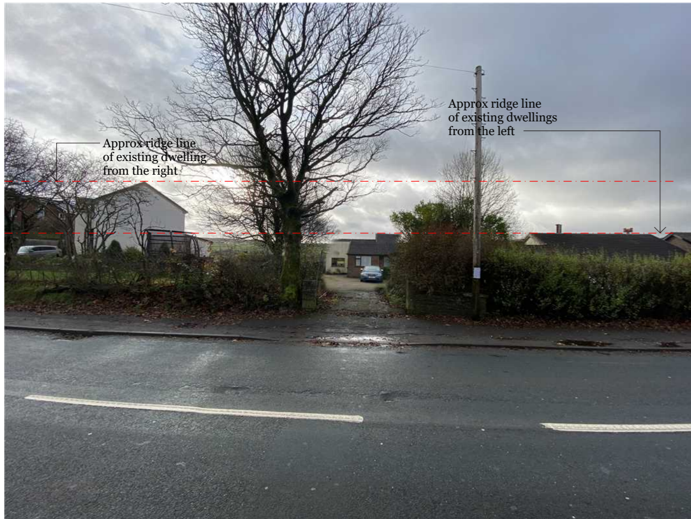
1 Proposed Sketch Visual from Booth Road Scale: NTS