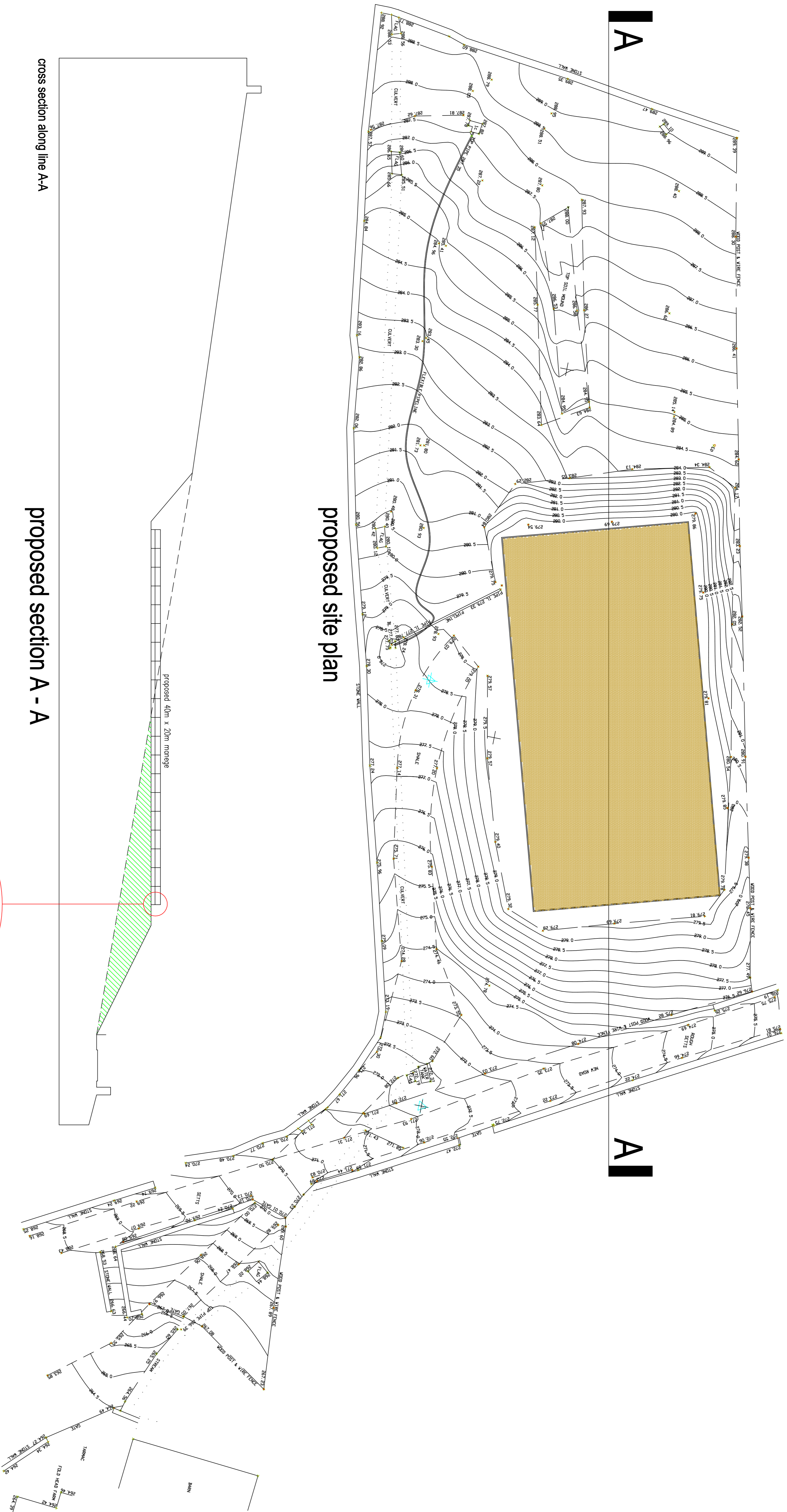
proposed site plan