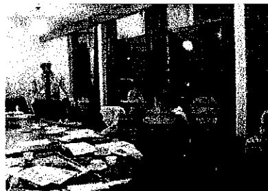
Councillors at an IDeA Scrutiny Training session at Bacup Leisure Hall in February 2007

"I was impressed with how far things appear to have progressed with regards to scrutiny at Rossendale. Members were speaking very positively and enthusiastically about scrutiny, and able to readily identify examples of scrutiny work they had done – some of which had successfully engaged the community and influenced policy and decision-making."