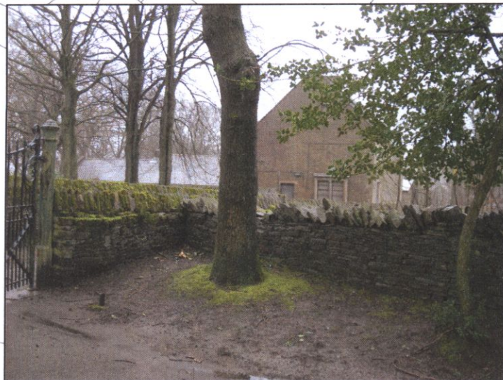
PHOTO A - Proposed railings to run parallel to low wall