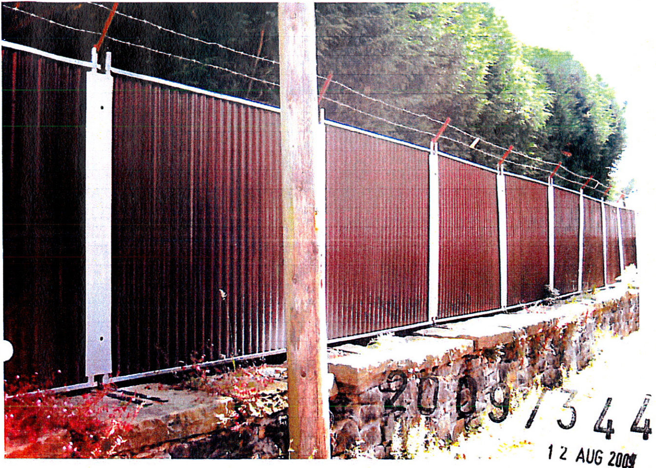
FROM POSITION 2 LOOKING DOWN 20mtr RUN