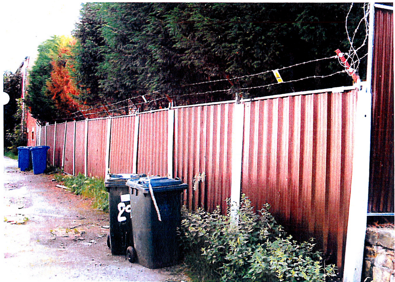
FROM POSITION 2 LOOKING DOWN 25mtr RUN