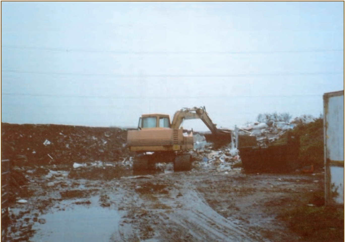
Photographic evidence of tipping on neighbouring land (paragraph 127).

This means that no citation, publication or notification of the contents are allowed before the time shown, but does not prohibit approaches to interested parties before the time of publication.