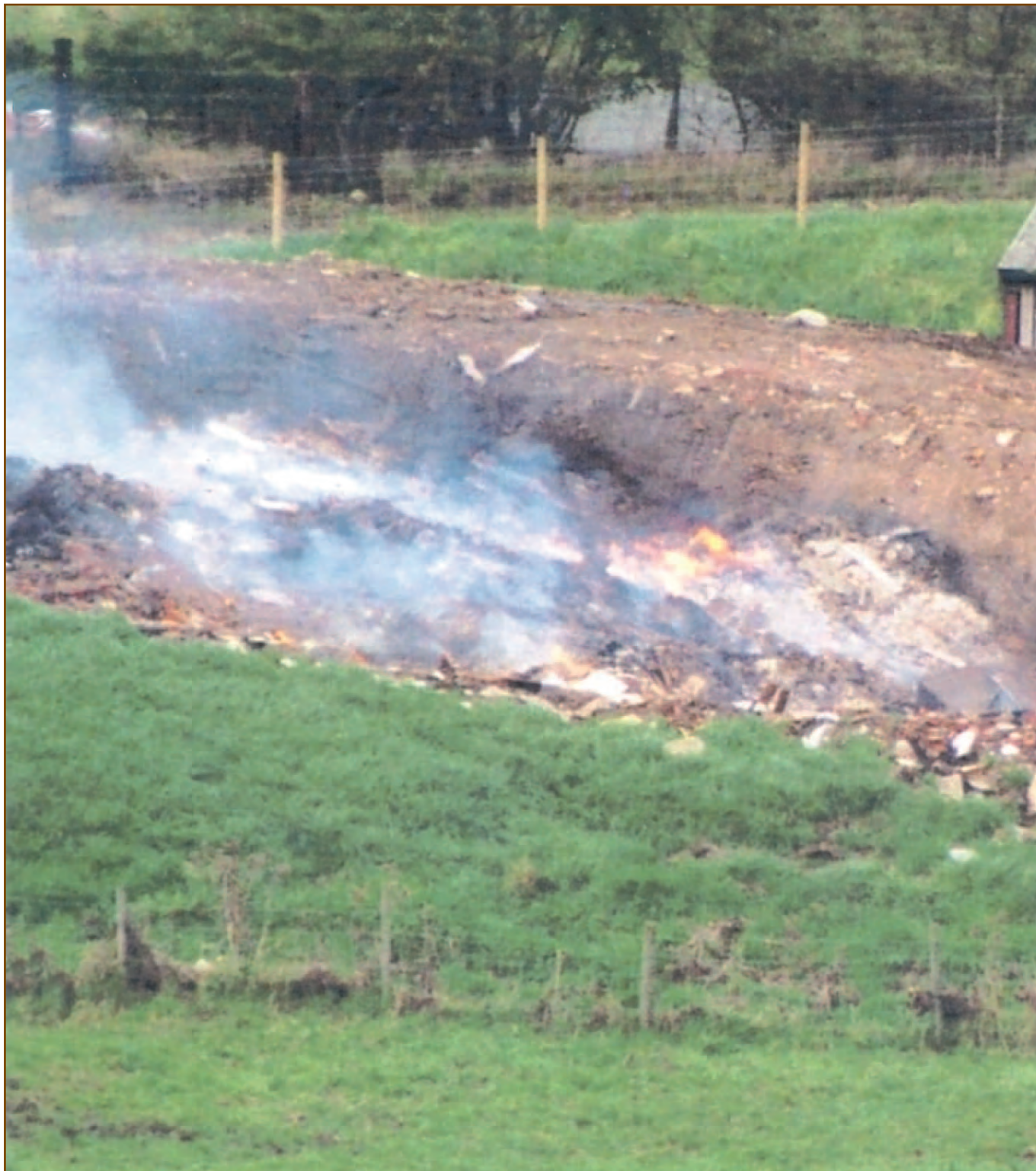
Photograph of the 'burning pit' on neighbouring land (paragraph 52).

This means that no citation, publication or notification of the contents are allowed before the time shown, but does not prohibit approaches to interested parties before the time of publication.