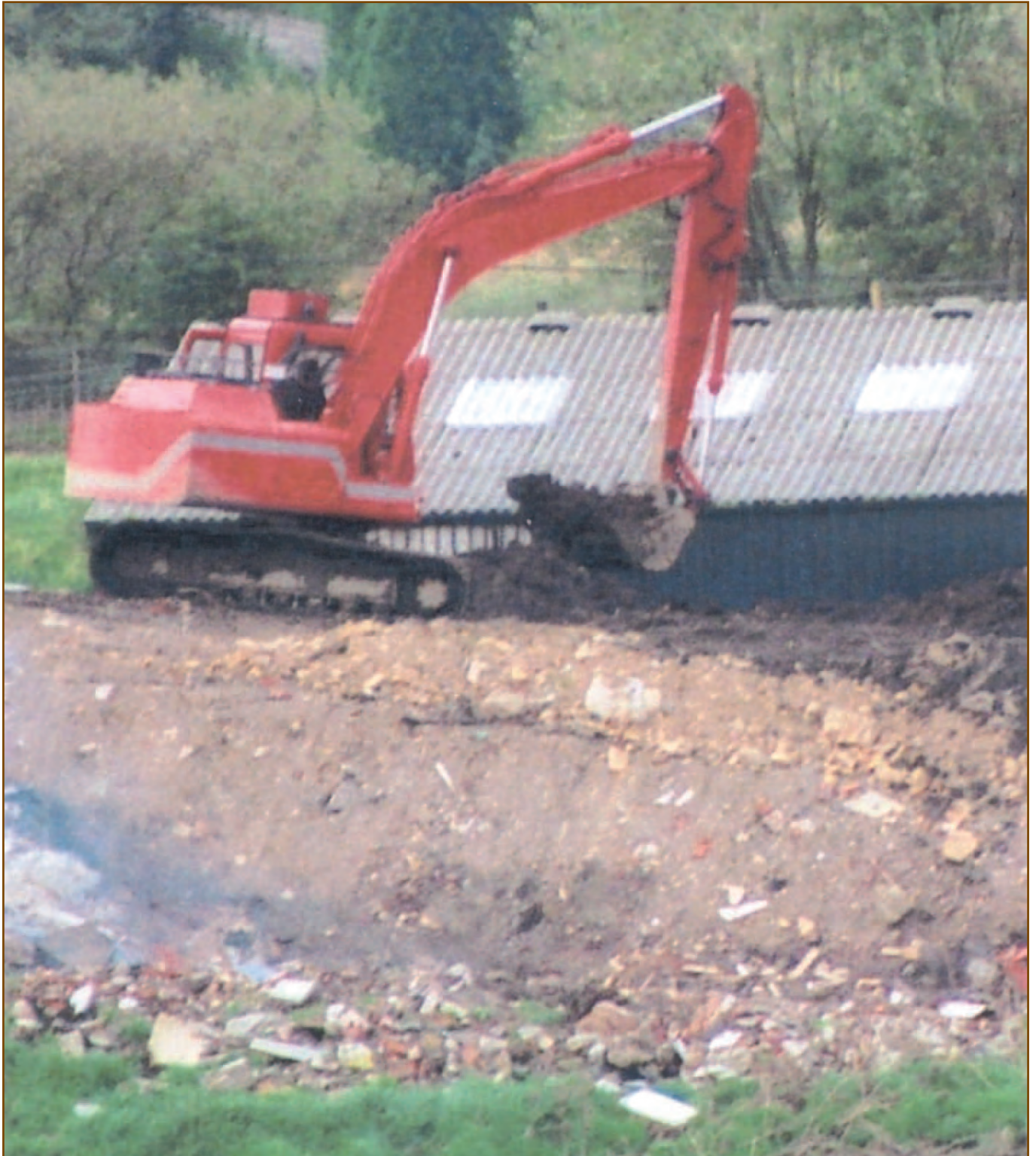
Photograph of excavation on neighbouring land (paragraph 51).

This means that no citation, publication or notification of the contents are allowed before the time shown, but does not prohibit approaches to interested parties before the time of publication.