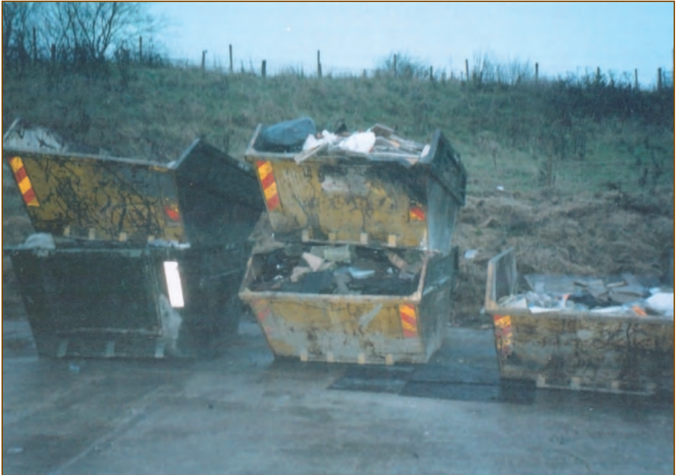
Photograph of skips on neighbouring land (paragraph 110).

This means that no citation, publication or notification of the contents are allowed before the time shown, but does not prohibit approaches to interested parties before the time of publication.