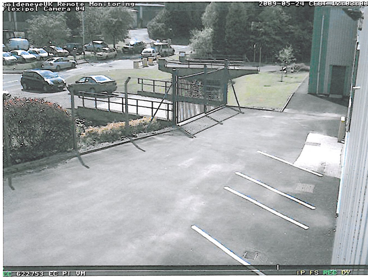
Car Boot Sale -Parking