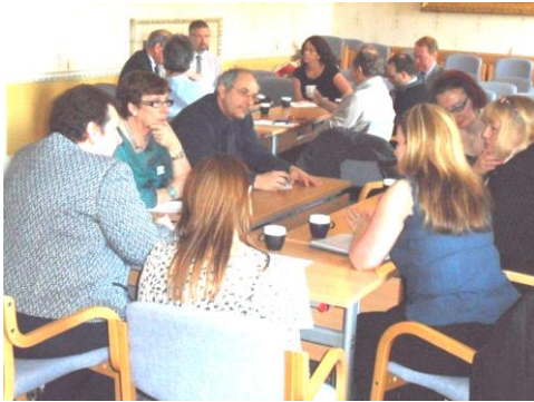
Discussion on partner scrutiny at the Network

Both Officers and Members have attended Scrutiny Network meetings including the Lancashire Scrutiny Partners Forum led by Lancashire County Council and the North West Scrutiny Support Officer Network, which is organised by North West Employers Organisation.