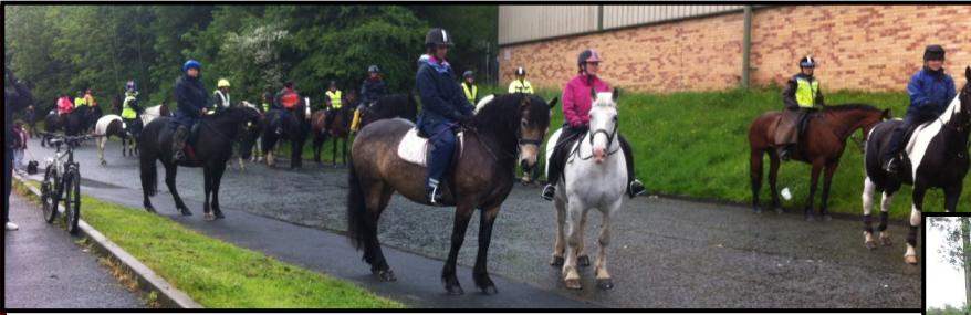
Stacksteads Friendly Riders

“Although the weather wasn’t great (to say the least) twenty-seven horses and riders, five cyclists, five walkers and four dogs braved the elements and completed the circuit.