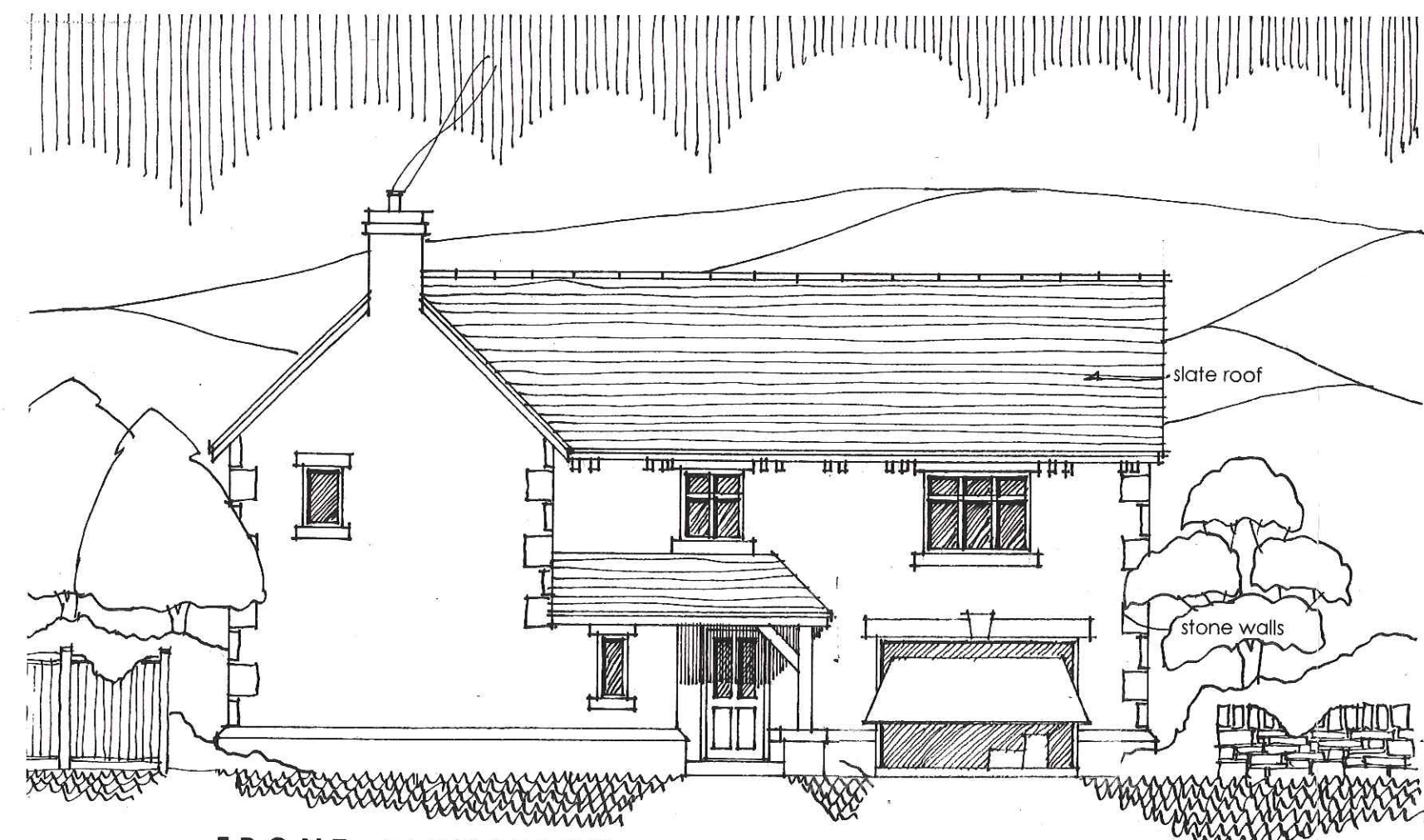
FRONT ELEVATION NORTH EAST