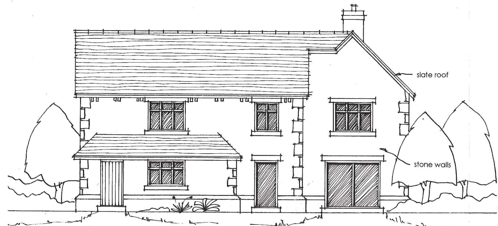
REAR ELEVATION SOUTH WEST