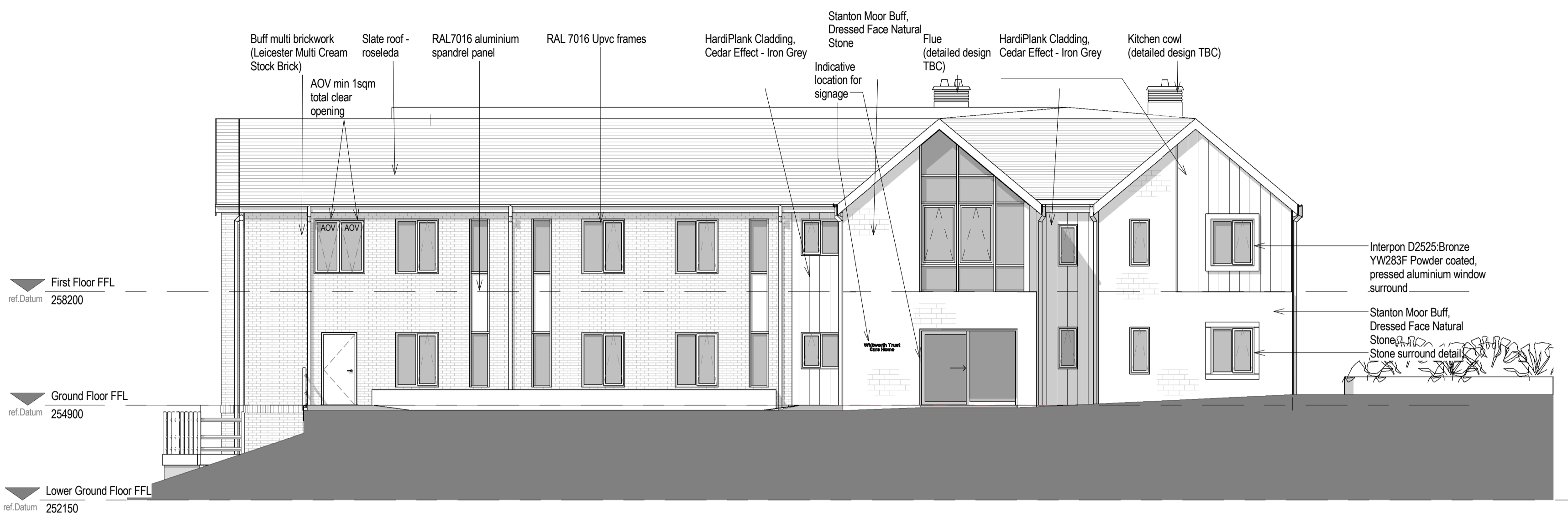
Proposed East Elevation 1 : 100

All level thresholds to have a double dpc