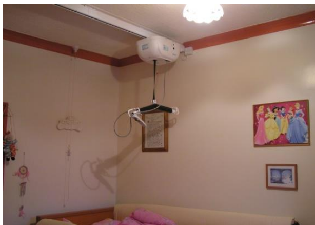
Ceiling Mounted Hoist

Please note; this is only a provisional indication of your contribution and you will be required to provide more detailed information when a full application is submitted.