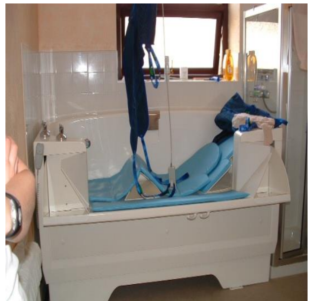
Height Adjustable Bath