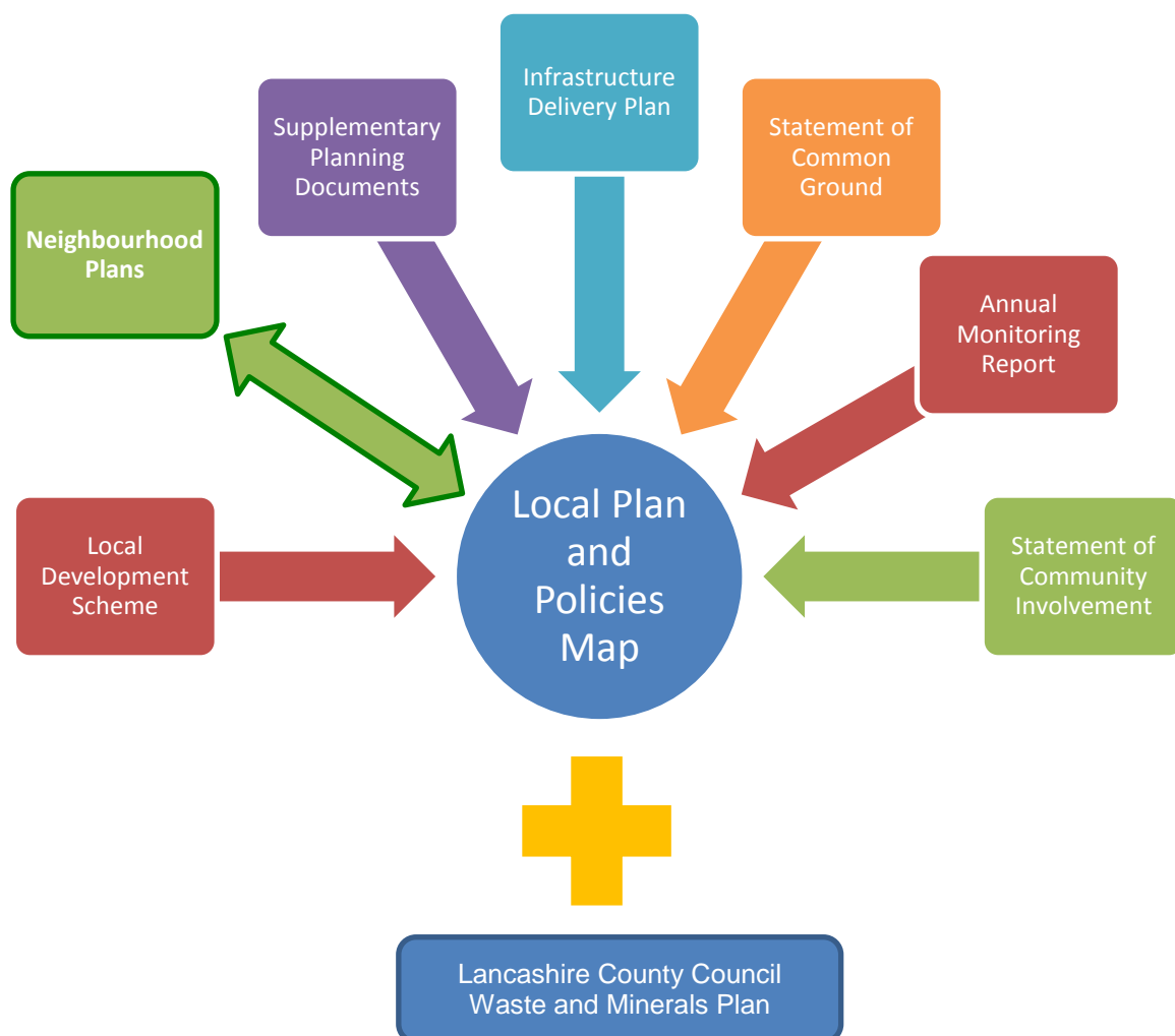
Figure 1: The Local Plan documents

1.9 The diagram and table over the page shows what documents will support the Local Plan for Rossendale.