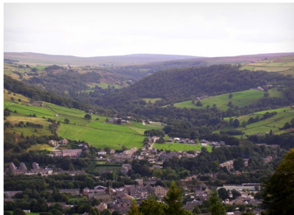
This view up Cragg Vale clearly shows the typical pattern of land cover in the South Pennines, with the stone-built settlement of Mytholmroyd on the valley floor, the woodlands on the steep side slopes and the pastures and moorland on the plateau above.

Biodiversity and geodiversity are crucial in supporting the full range of ecosystem services provided by this landscape. Wildlife and geologically-rich landscapes are also of cultural value and are included in this section of the analysis. This analysis shows the projected impact of Statements of Environmental Opportunity on the value of nominated ecosystem services within this landscape.