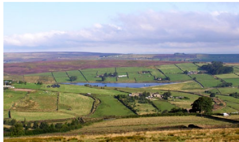
Leeshaw Reservoir, one of the many reservoirs constructed to supply the expanding towns and cities to the east, sits within a pastoral landscape with moorlands on the higher land.

http://www.cpre.org.uk/resources/countryside/tranquil-places