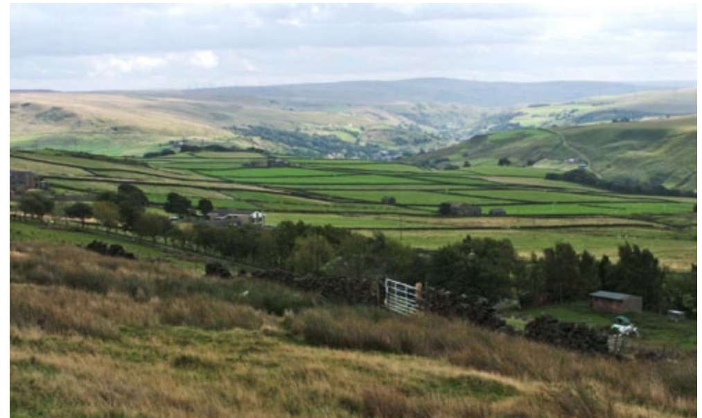
The sweeping moorlands and upland pastures contrast with the enclosed valleys with their wooded sides and settlements.