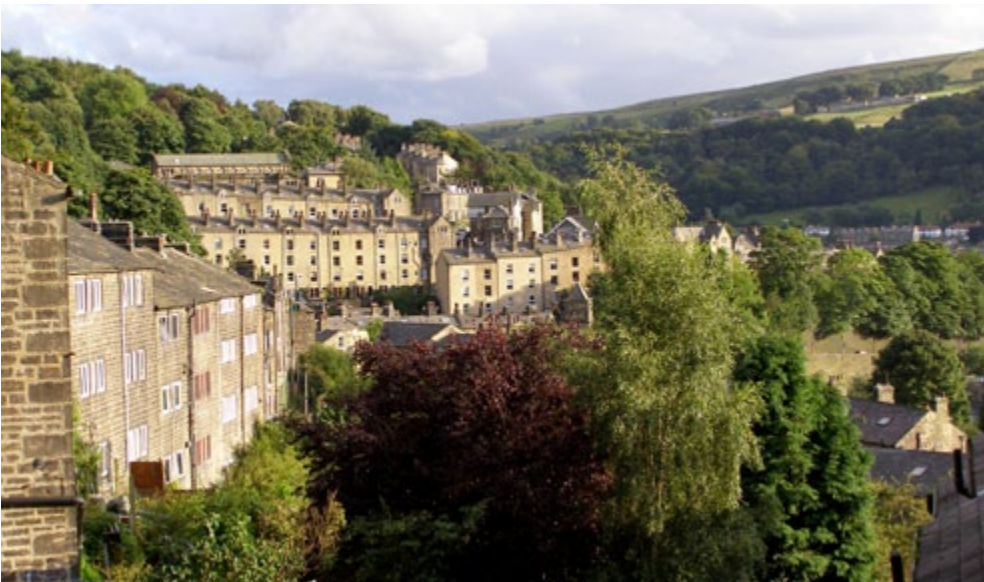
The widespread use of local sandstone for building creates a distinctive and unified appearance.

Over recent decades, there has been a continuing pressure from development in the area, especially in the east and south, with a large number of barn conversions. Farmsteads continue to be sold off separately from the land, with