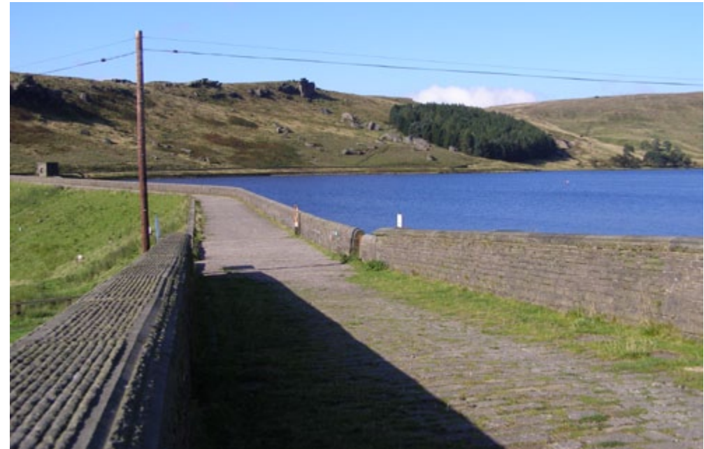
The many reservoirs are popular with visitors, as well as providing habitats for wildlife and drinking water for adjacent populations.