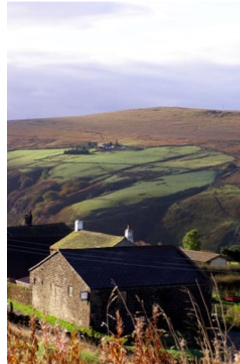
Over time, farms have carved out pastures from the moorlands, as here with these stone built farmsteads above Cliviger Gorge.

On higher land, there are extensive areas of semi-natural habitats with the different types of moorland vegetation fluctuating in response to grazing regimes, exposure, hydrology and management. In places, the effects of enclosure, grazing, uncontrolled burning and atmospheric pollution have resulted in vegetation dominated by purple moor grass, mat grass and cotton grass. The