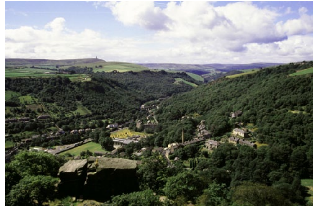
Terraced housing, mills and roads can be seen contained within the well-wooded Calder Valley.

Extensive woodland clearance of higher land during the later Neolithic period