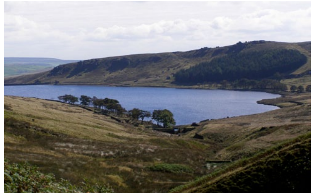
The high rainfall and impervious rocks create good conditions for reservoirs, which form dramatic and popular features within the landscape.

■ Water availability: This NCA provides a valuable water catchment area for northern England. This is due to the high levels of rainfall in the area and the presence of a large number of reservoirs, including Rivington, Worsthorne, Widdop, Watersheddles, Gorpley and Blackstone Edge, the locations of which are due to a combination of the topography and impervious rock types. The Southern Pennines are the source of many major river systems. These rivers provide a source of freshwater to many neighbouring NCAs.