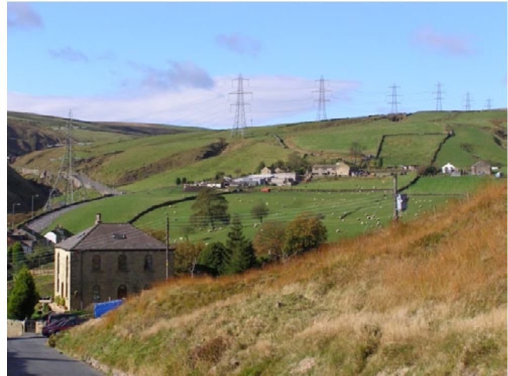
The layers of history are always evident in the South Pennines. Here 20th-century pylons cross Todmorden Moor above a farmstead established many centuries ago on the spring line and a 19th-century non-conformist chapel, now converted to residential use.