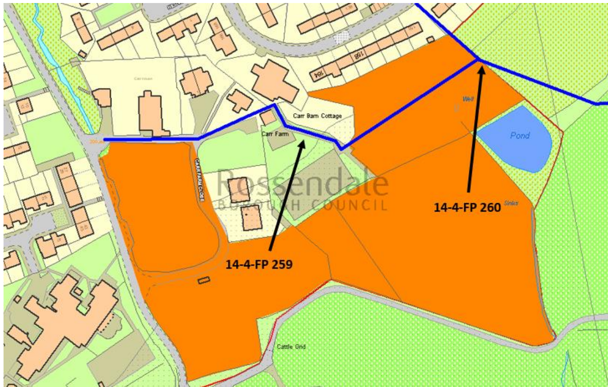
Figure C: PROWs within site allocation H18

© Crown copyright and database rights [2021] OS [100023294]