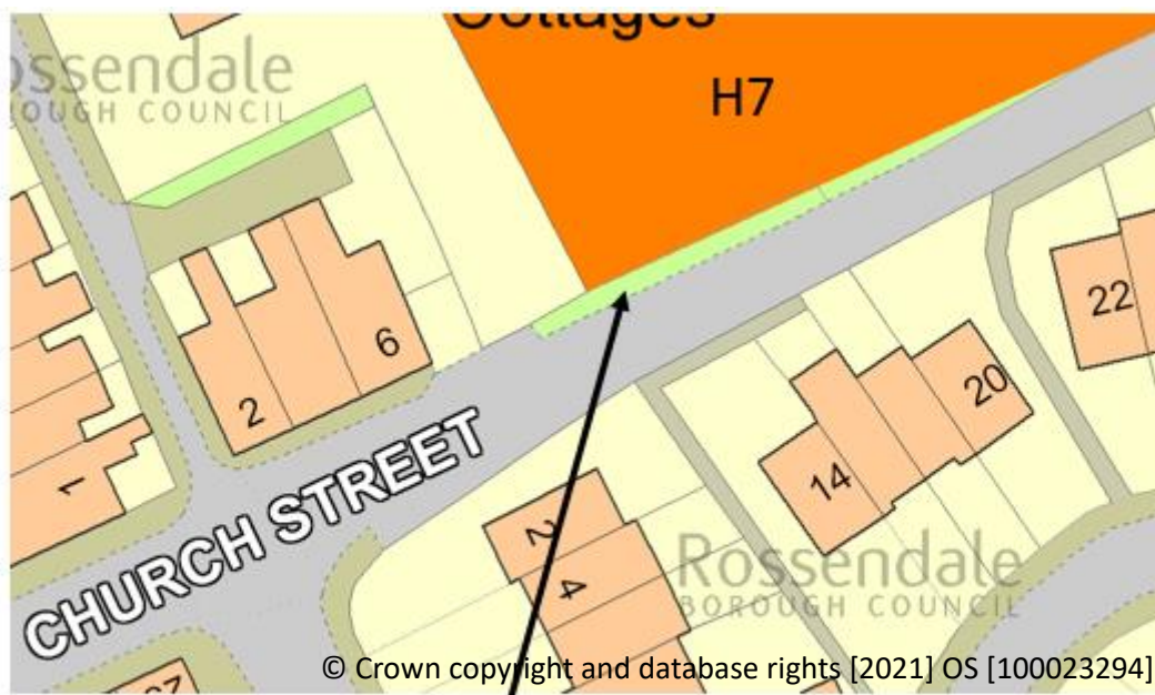
Figure B: Strip of land outside site allocation H7

The strip of land identified at the Hearing Session as a potential constraint to accessing the site.