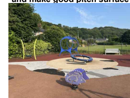
replace existing play area surfacing