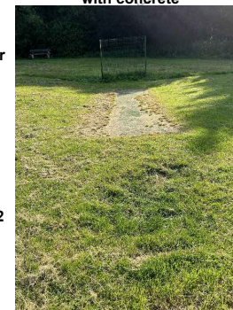
fix cricket wicket and repair the sand filled carpet