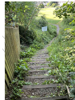
existing timber steps replaced with concrete