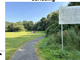
footpath surface scraped and made good; signage replaced