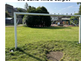
move position of goalposts and make good pitch surface